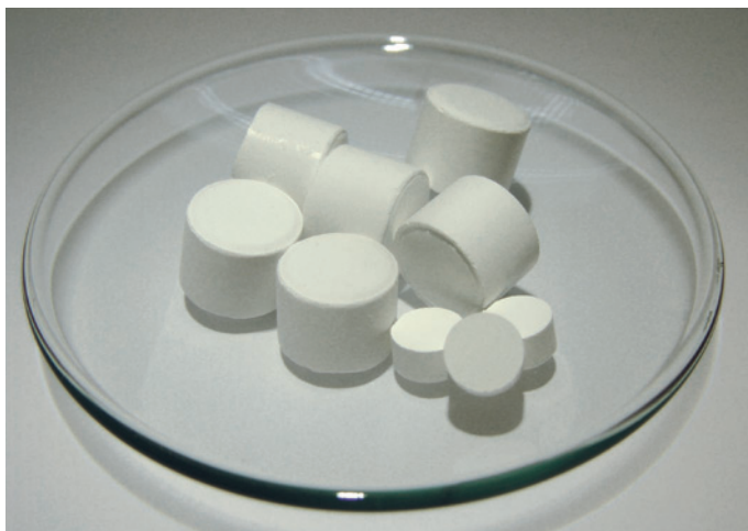
Topcoat E™ tablets (large and small).

Alternatively, coating is done in constant power mode or by rate control. Special guidelines apply to each of the mentioned coater types and techniques. Only minimal process adjustment is necessary for substitution of any topcoat material by Topcoat E™.